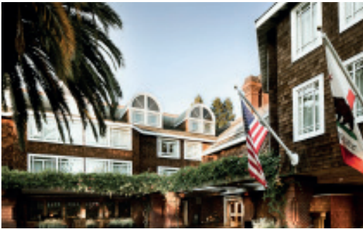
Open networks made the hotel's EV charging stations accessible to more than 1 million EV drivers in the U.S.